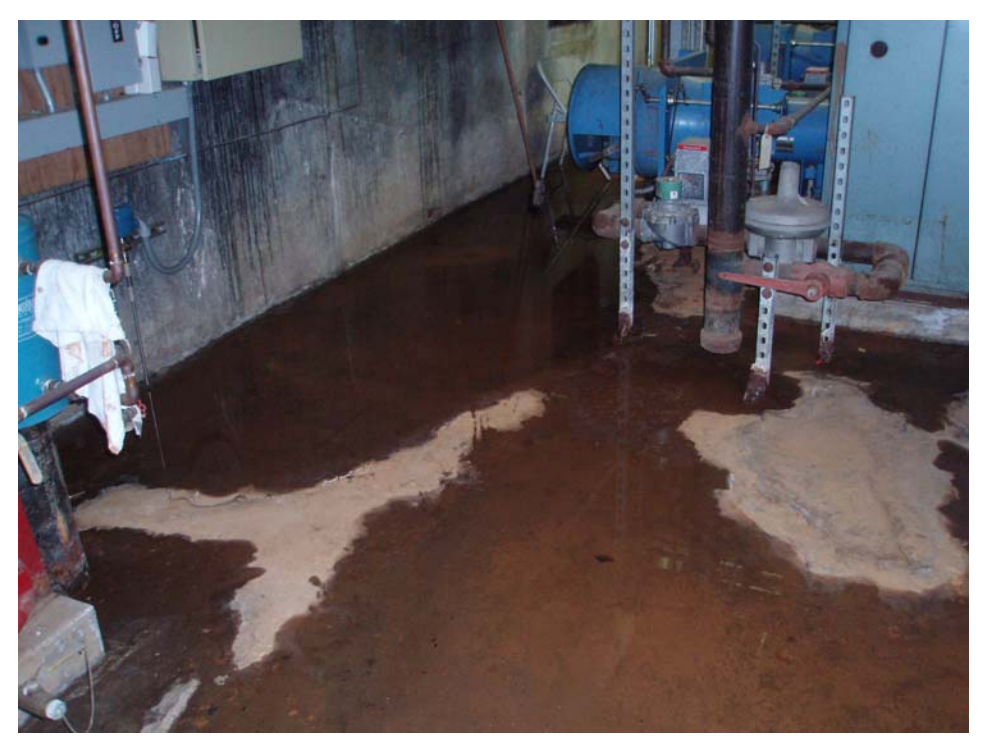
Picture 1.11. View of Smith basement boiler room, showing water infiltration.