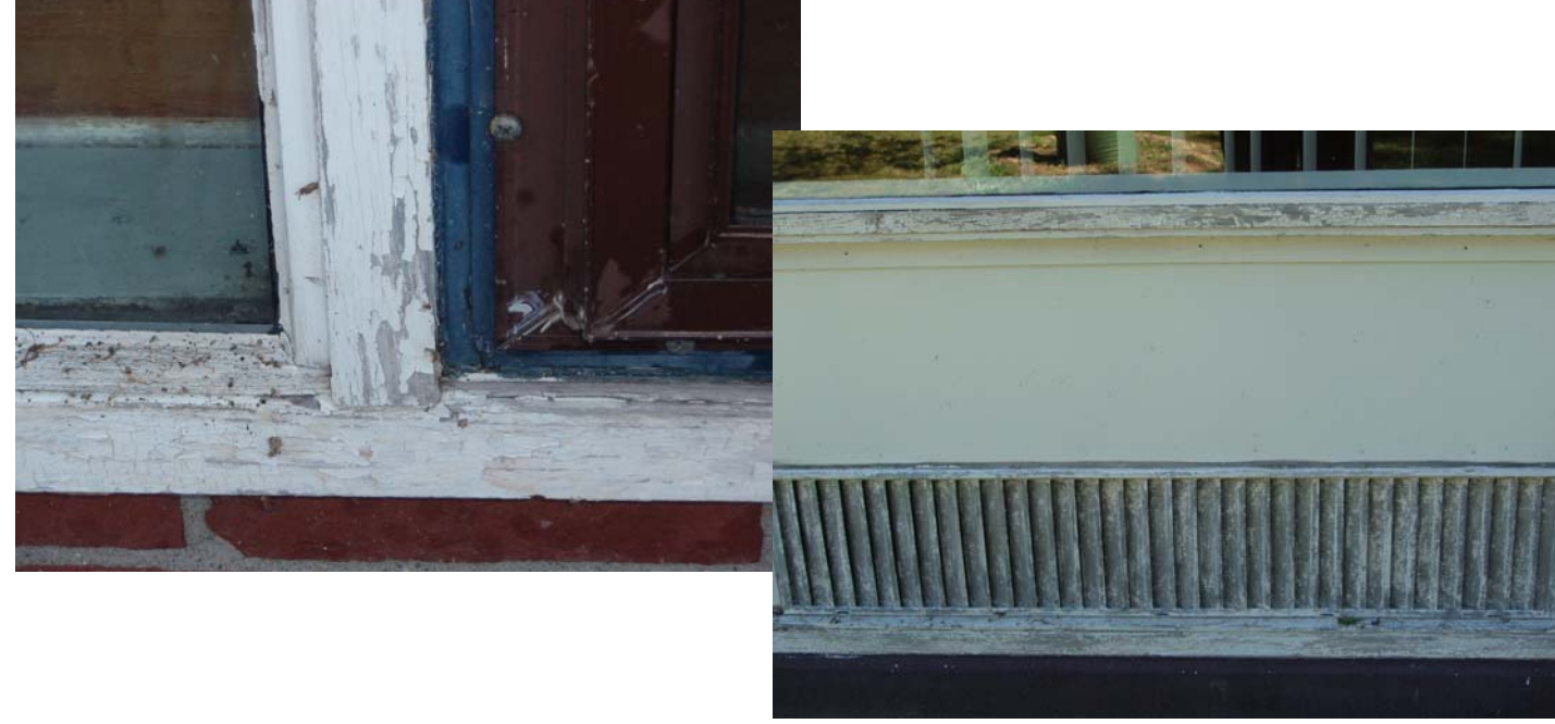
Pictures 1.51 through 1.53. Condition of Brooks window curtain walls, showing deteriorated panels and rotting trim.