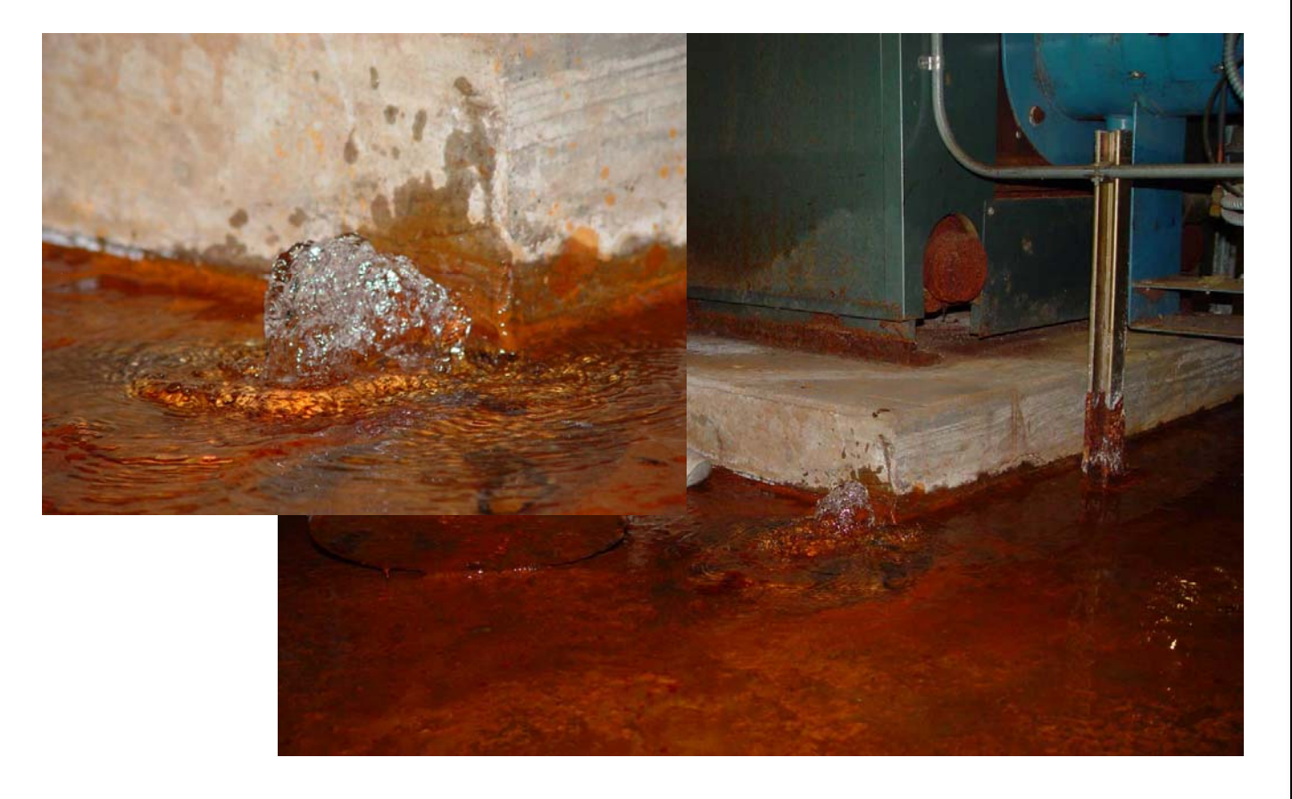
Picture 1.12. Smith basement, showing water damage to boiler (typical)